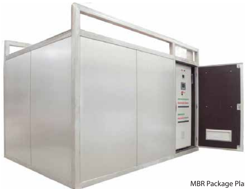
MBR Package Plant MW-MR150