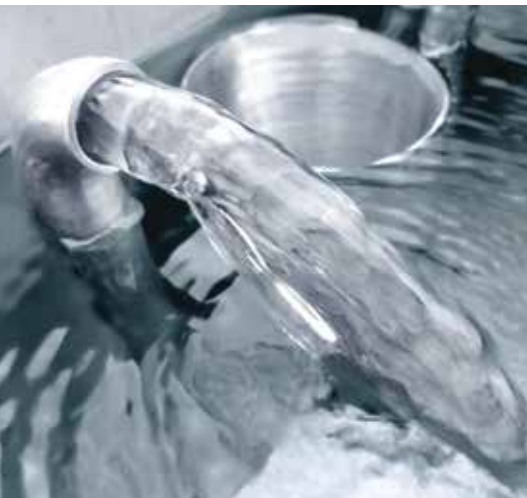
Clean Effluent Water