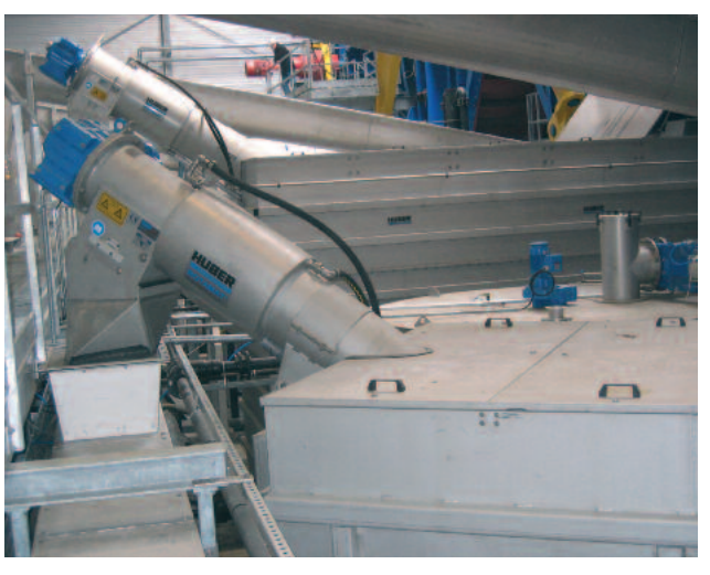
... from size 600 to size 2400