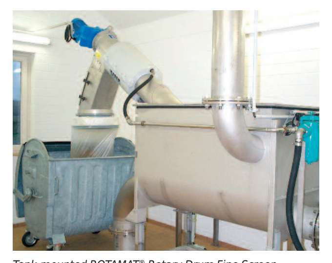
Tank-mounted ROTAMAT® Rotary Drum Fine Screen ...