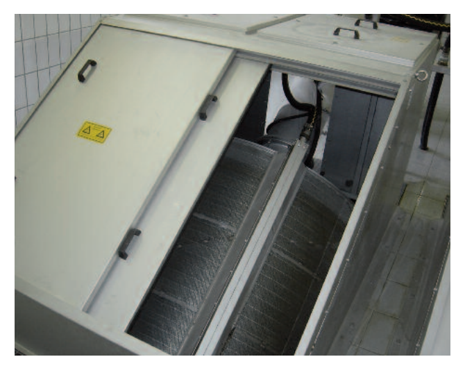
ROTAMAT® Rotary Drum Fine Screen Ro 2 installed in the channel with a movable stainless steel cover, size 600 to 3000