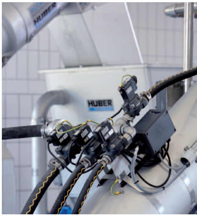
ROTAMAT® Rotary Drum Fine Screen with integrated screenings washing IRGA

The dewatering performance can be increased to more than 45 % DR by adding a high pressure unit (HP) to the integrated screenings washing system IRGA. This combination guarantees the maximum dewatering performance and reduces disposal and operating costs.