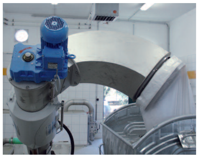
Individually adapted installation with lateral screenings discharge directly into a container