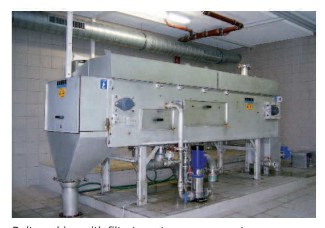
Belt washing with filtrate water as spray water