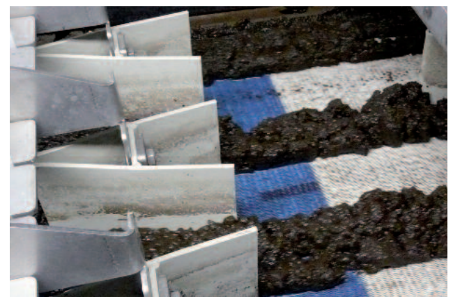
Chicanes furrow the sludge to facilitate drainage and support the production of a concentrated sludge cake