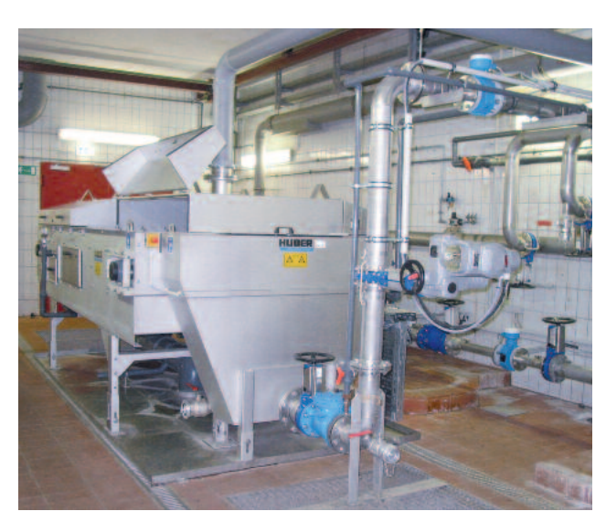
Belt thickener for 60 m<sup>3</sup> thin sludge per hour