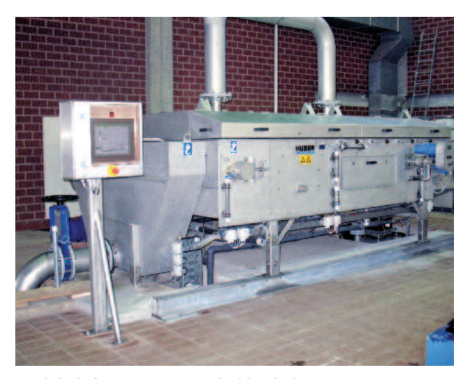
Drainbelt for up to 100 m<sup>3</sup>/h thin sludge