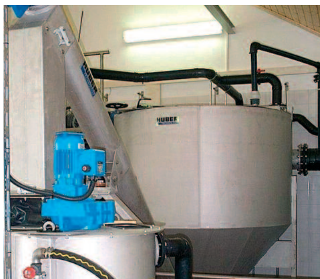
HUBER Circular Grit Trap HRSF with integrated classifying screw and subsequent HUBER Grit Washer RoSF4/t

The layout of the HUBER Circular Grit Trap HRSF was made on the basis of numeric design engineering and tested and verified under practical conditions in collaboration with the German test institute LGA.