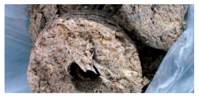
Washed and compacted screenings - the ideal fuel

Solids concentration of screenings, depending on the WAP type used: Up to 50 % DS.