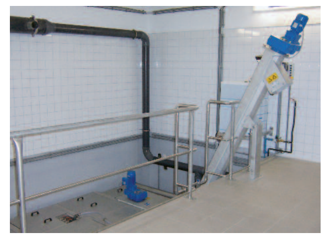
Integrated grit washing at the end of the ROTAMAT<sup>®</sup> Complete Plant Ro5