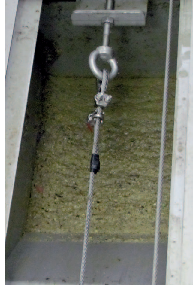
Paddle scraper for grease removal from the grease trap. According to the principle of a longitudinal grit removal scraper the grease paddle pushes the floating fat and grease into the pump sump.

In contrast to many competitors, the floating fats and oils are skimmed off the water surface with a paddle scraper that is slowly pulled with a stainless steel rope. The paddle is shaped so that it removes virtually all floating matter from the grease trap. Anaerobic degradation of fat and grease, and there-with odor nuisance, is thus prevented.