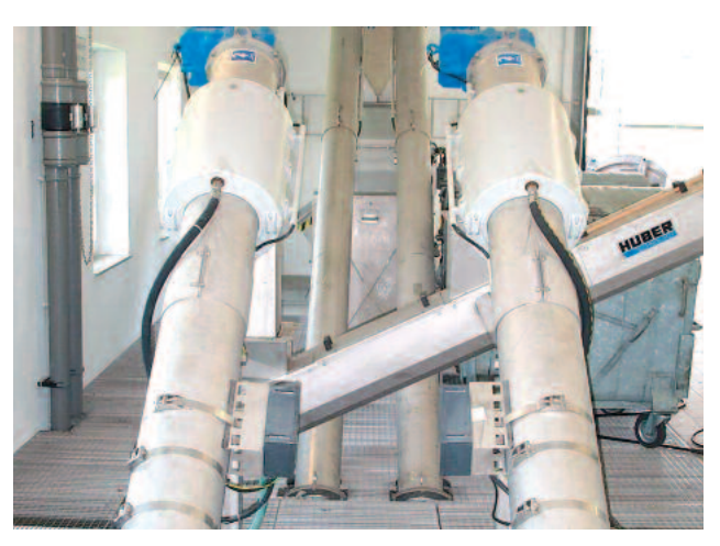
Underground, redundant ROTAMAT® Complete Plant Ro5

Subject to technical modification 1,0 / 5 – 8.2010 – 9.2003