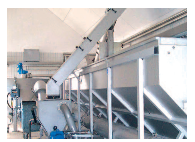
Intensive washing of screenings in a WAP/SL Wash Press subsequent to a ROTAMAT<sup>®</sup> Complete Plant Ro 5