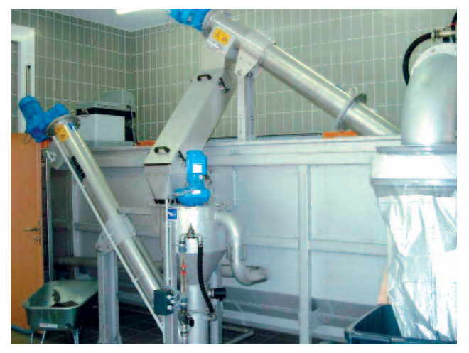
Classifying screw with subsequent HUBER Grit Washer RoSF 4/tC

The classified grit slides from the upper end of the inclined screw into a HUBER Grit Washer RoSF 4/t.