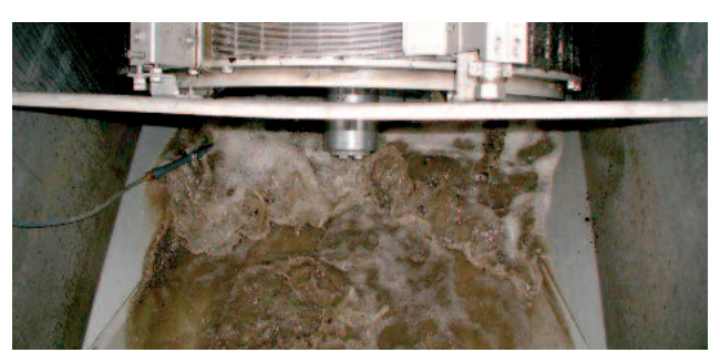
Well-proven wastewater fine screen: ROTAMAT<sup>®</sup> Rotary Drum Fine Screen Ro 2

Other separation sizes can be supplied on demand. Separate brochures are available for these screens and the WAP.