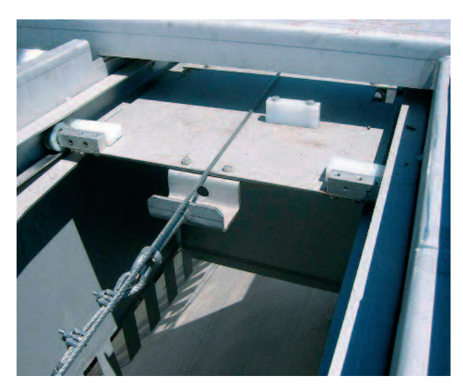
Semi-automatic grease removal by means of a paddle system