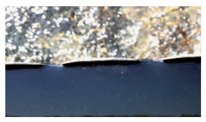
Activated sludge flocs sometimes are insufficiently retained by the secondary clarifier.