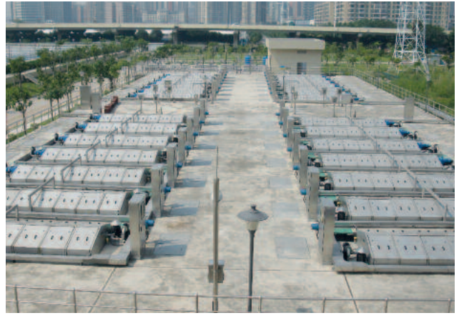
28 RoDisc<sup>®</sup> Rotary Mesh Screen units with 24 discs each treating about 8.5 m<sup>3</sup> wastewater per second