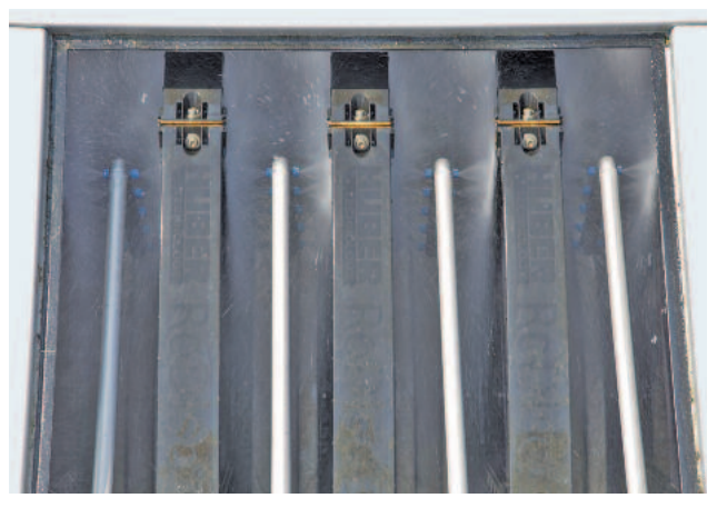
Backwashing of filter discs with filtrate – no external wash water required

Subject to technical modification 0,15 / 7 – 4.2012 – 4.2005