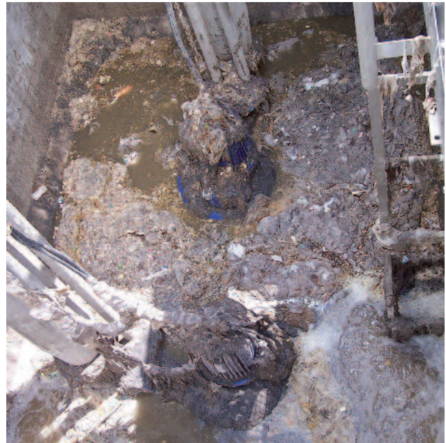
Clogged pumps caused by the solids within the medium to be delivered

The top of the inflow chamber is open and serves as an emergency bypass so that the machine can be submerged without problems, e.g. in case of a power failure. The integrated bottom step prevents back-flooding into the sewer system and thus undesired deposits in the incoming sewer.