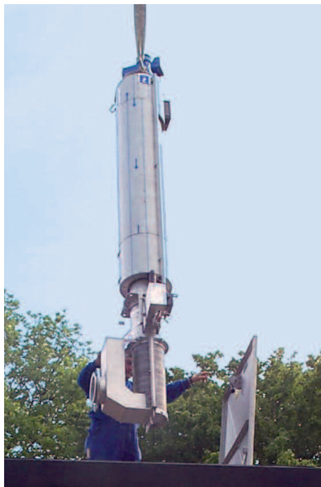
ROTAMAT® Pumping Stations Screen RoK 4 being lifted into a pumping station