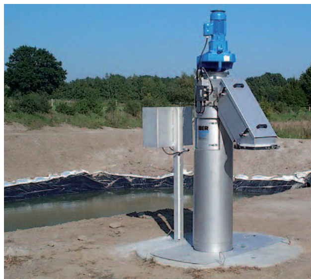
Installation upstream of a pond plant