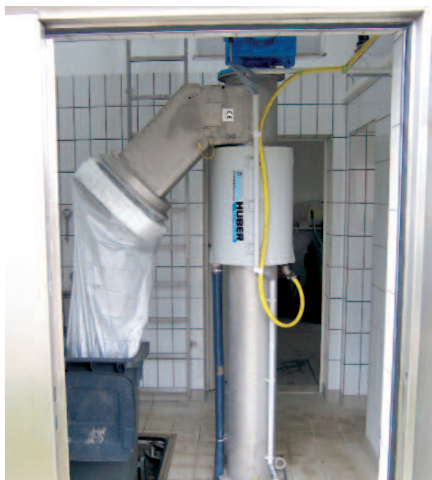
Screenings discharge into a bagger for odour-free disposal