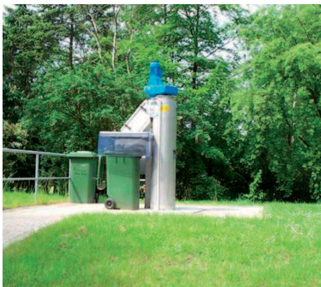
Frost protected outdoor installation

A selection of installation examples will convince you of the ROTAMAT® Pumping Stations Screen RoK 4.