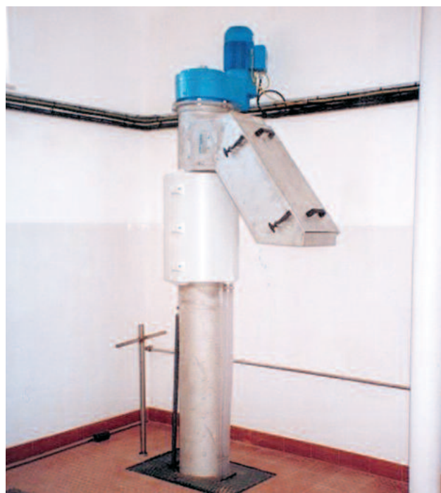
Indoor installation on a small footprint