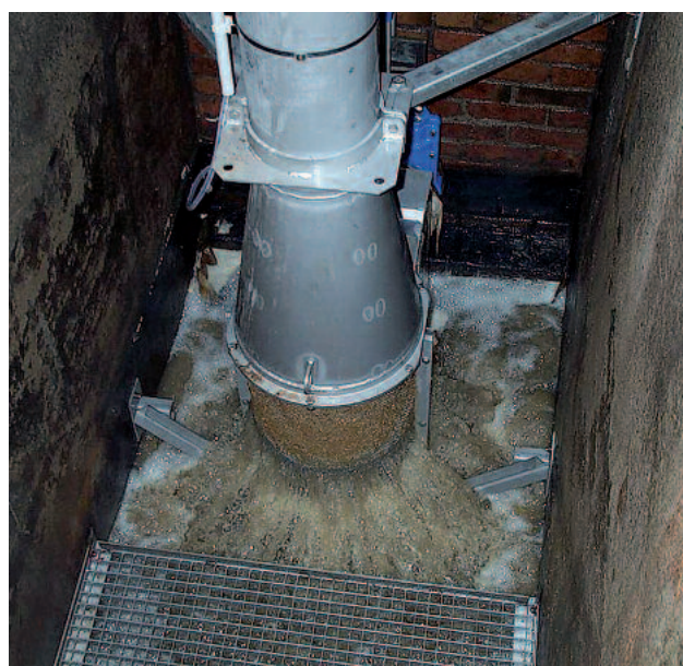
ROTAMAT® Pumping Stations Screen RoK 4 in operation