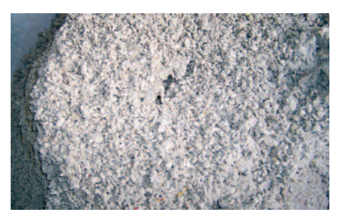
Particularly hair and fibres are separated by means of the two-dimensional square mesh design.

The screen basket surface consists of a square mesh that ensures high separation efficiency and provides a large