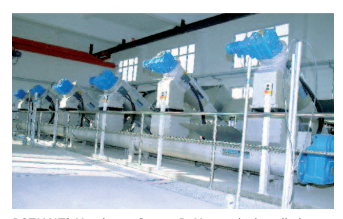
ROTAMAT® Membrane Screen RoMem units installed to protect a large downstream MBR plant