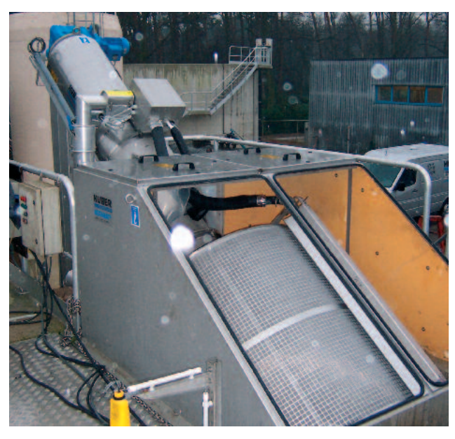
Outdoor installation with cover and insulated spray water line