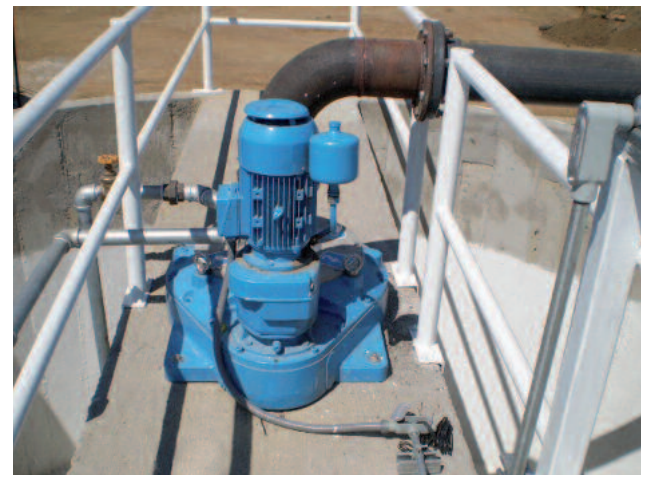
Reliable bull gear drive for the stirrer